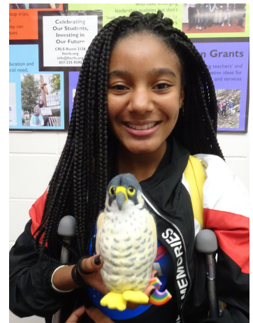
Zora and Friendly