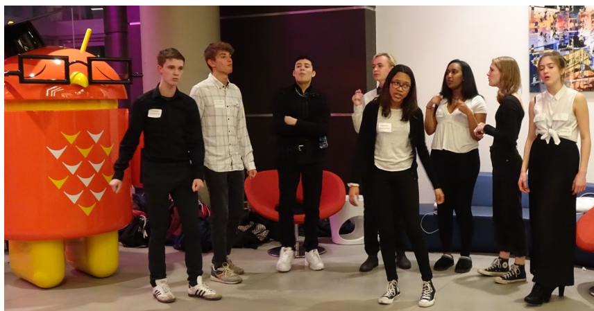
Clockwise from top: Bash attendees, Bash attendees, CRLS a cappella group Girls Next Door, CRLS a cappella group Pitches and Does