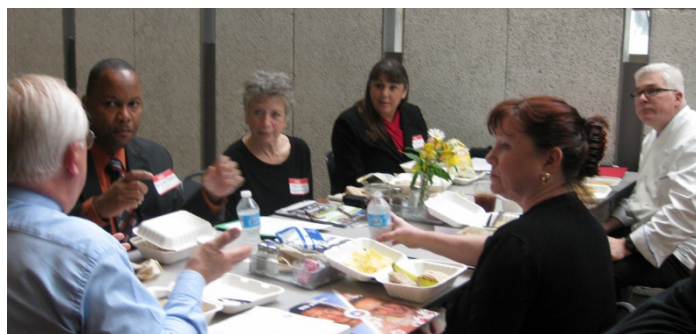
The Hyatt Hotel leadership team visits CRLS and hears about internships for RSTA culinary arts students

FOCRLS also continued to build its relationships in the Cambridge business community. In an exciting development, FOCRLS was able to facilitate a visit by members of the Hyatt Hotel Cambridge leadership team to the RSTA culinary program, leading to a Hyatt pledge of a culinary internship for CRLS students. FOCRLS hopes to be able to further promote partnership with the Cambridge business community, expanding the horizons of CRLS students.