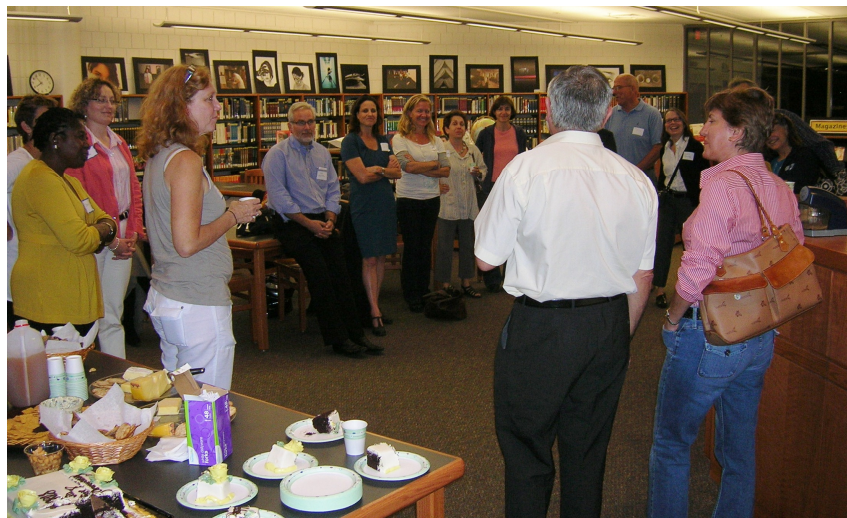
Parents mingle at the FOCRLS September 2011 Open Meeting in the CRLS Library

FOCRLS holds bi-monthly open meetings at CRLS, enabling CRLS parents and other interested members of the community to come together, hear about FOCRLS activities, and find out how to get involved. The 2011-12 school year included a FOCRLS open meeting welcoming 9 th grade parents, another focused on CRLS student trips, another devoted to Cambridge business community outreach, and one on FOCRLS brainstorming and planning.