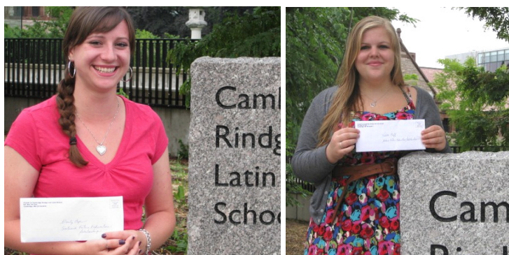
2012 Dr. Christopher Saheed Future Educators Awardees