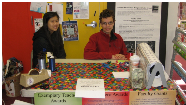
Students help giftwrap for tips at Henry Bear's Park to benefit FOCRLS