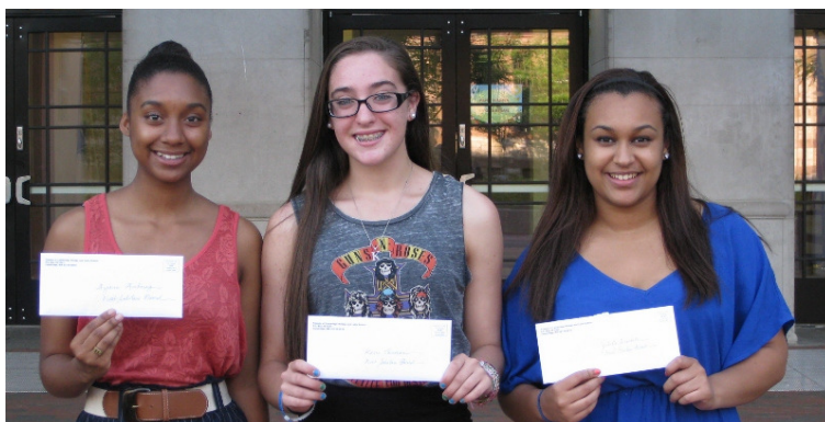
2012 First Scholars Awardees

"I cannot explain how grateful I am for the opportunity you have given me. I hope you give many other children the same chance. I look forward to presenting Turkey and its wonders to you in my journal soon." – 2012 FOCRLS Student Travel Fellow, Turkey Trip