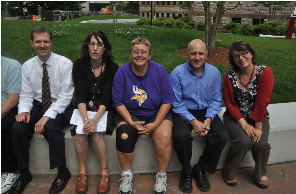
2010 Faculty Grantees