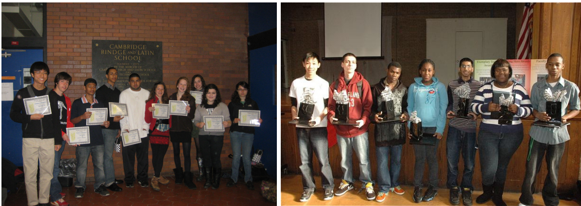
Unsung Heroes Spring 2010

This year's awardees were presented with certificates, gift cards, and customized watches with the CRLS Falcon logo at the main campus during a breakfast program attended by their family members, deans of students, counselors, and FOCRLS representatives, and at the 9 th grade campus at an assembly attended by their peers.