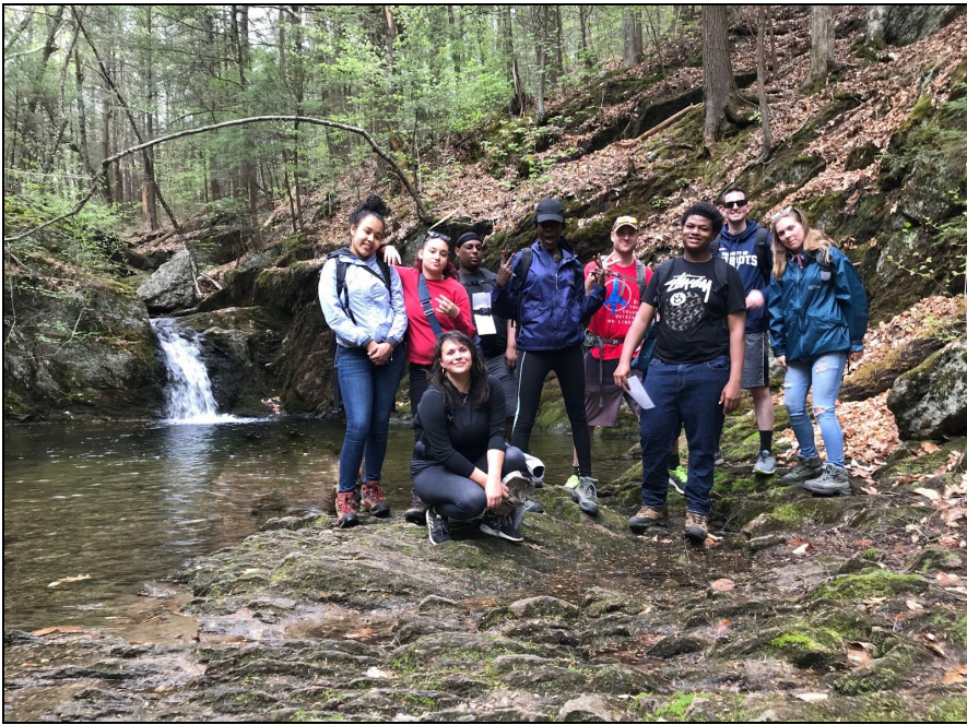
“Mountain Classroom Trip for the Students of HSEP”