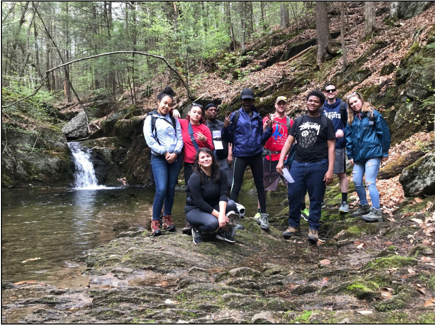
“Mountain Classroom Trip for the Students of HSEP”