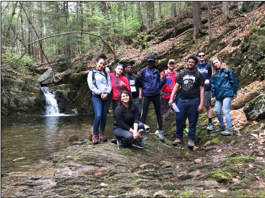
“Mountain Classroom Trip for the Students of HSEP”