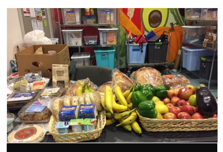
"Falcon's Market" 2016