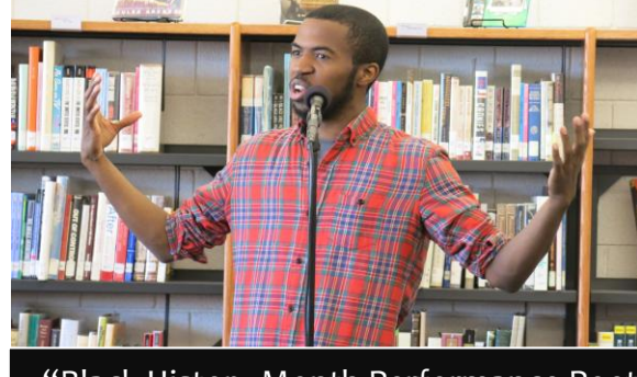
"Black History Month Performance Poetry Celebration featuring Joshua Bennett" 2012