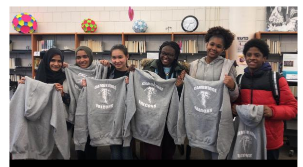
"CRLS Department of English Language Learners Community Building Project" 2019