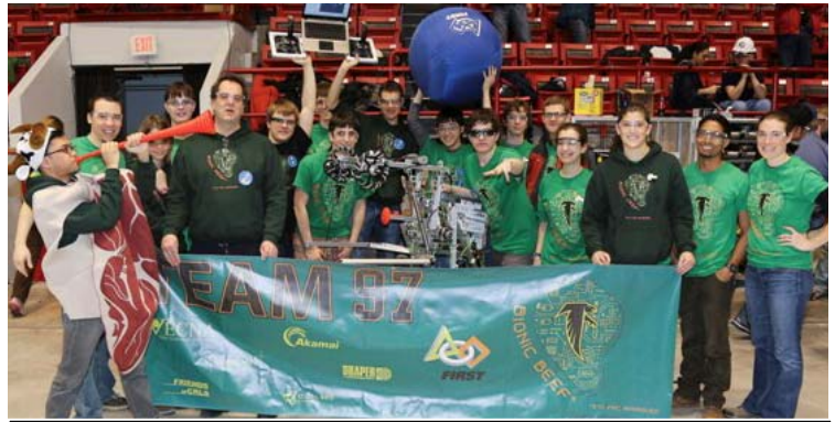
“Funding for FIRST Robotics Club 2014 Season”