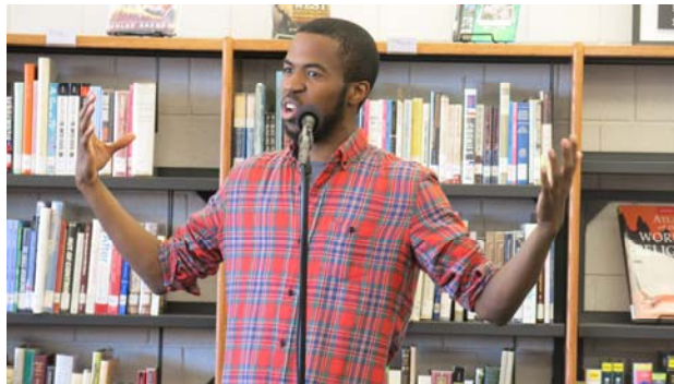
"Black History Month Performance Poetry Celebration featuring Joshua Bennett"