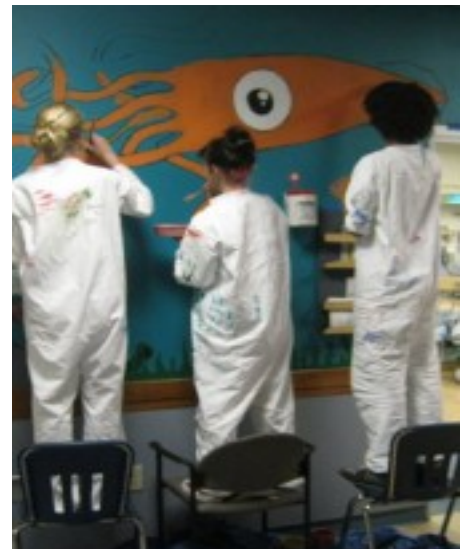
“Student Mural at Cambridge Hospital”