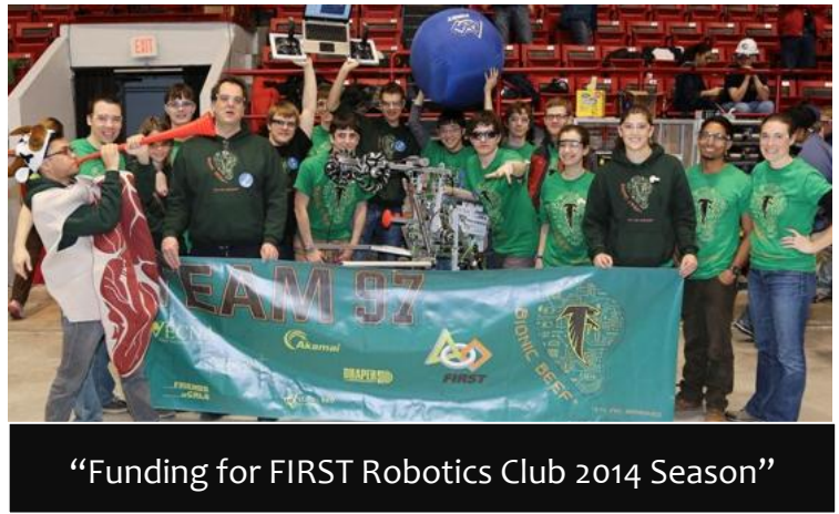
“Funding for FIRST Robotics Club 2014 Season”