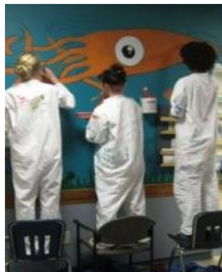
“Student Mural at Cambridge Hospital”