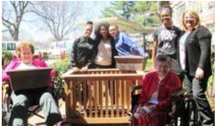
“Rolling Planters for... Residents”